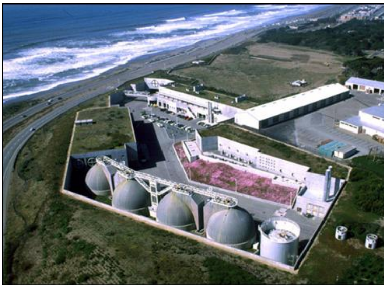
Figure 1 – Water / wastewater facilities, such as this one in San Francisco, typically may not have prioritized cyber security. Nowadays, however, attacks on PLC-based systems are increasing.

This was the situation in a mid-sized city in the Eastern U.S. In 2012, the Department of Water Resources upgraded their SCADA network to industrial Ethernet. At the time, there was little protection or separation of the SCADA network from the city's IT network. While this provided many benefits, it also made the controls network susceptible to malware attacks and traffic storms.