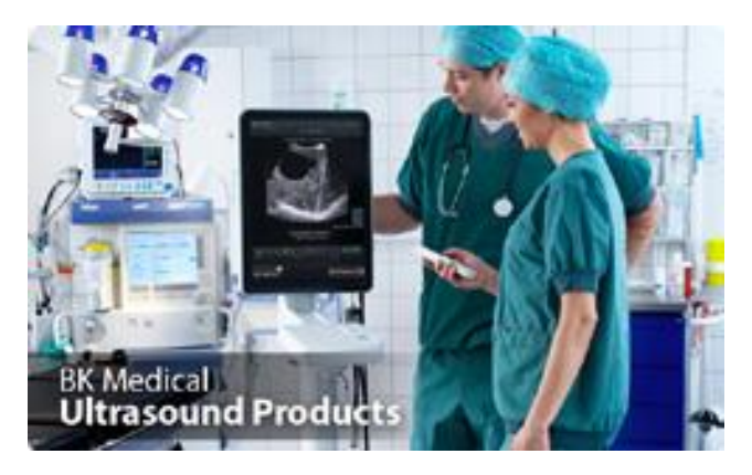
Figure 1. Modern standalone ultrasound system.

Modern ultrasound medical systems serve a number of diagnostic and therapeutic functions. Although they are designed to be portable and easy to use, they are standalone systems that meet specific needs at a specific place and time. Image interfaces and connectors are built to enable access to the patient information they gather, which is essentially centered around the device (Fig. 1).