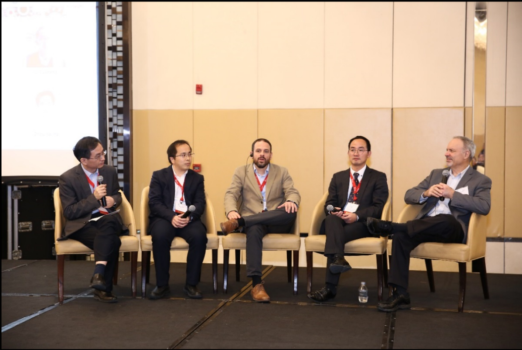
Panel: Smart Manufacturing