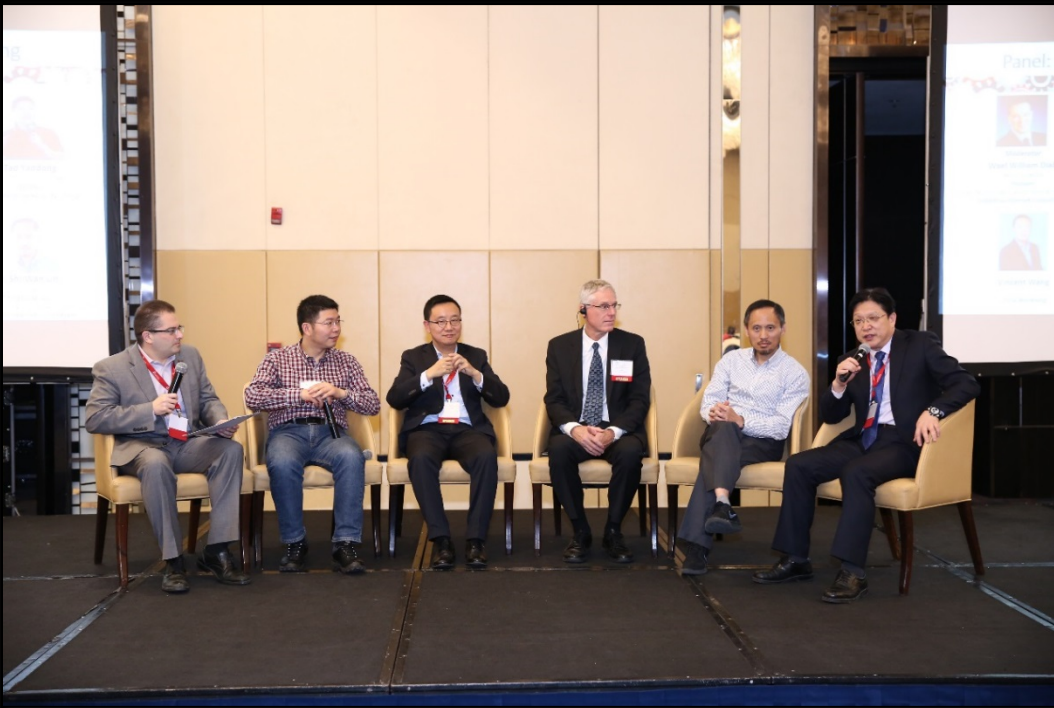
Panel: AI Empowering Smart Manufacturing